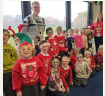
Christmas Jumpers (Year 2)