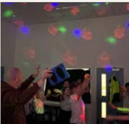
Christmas Disco (Year 6)