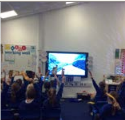
Polar Express Day (Year 3)