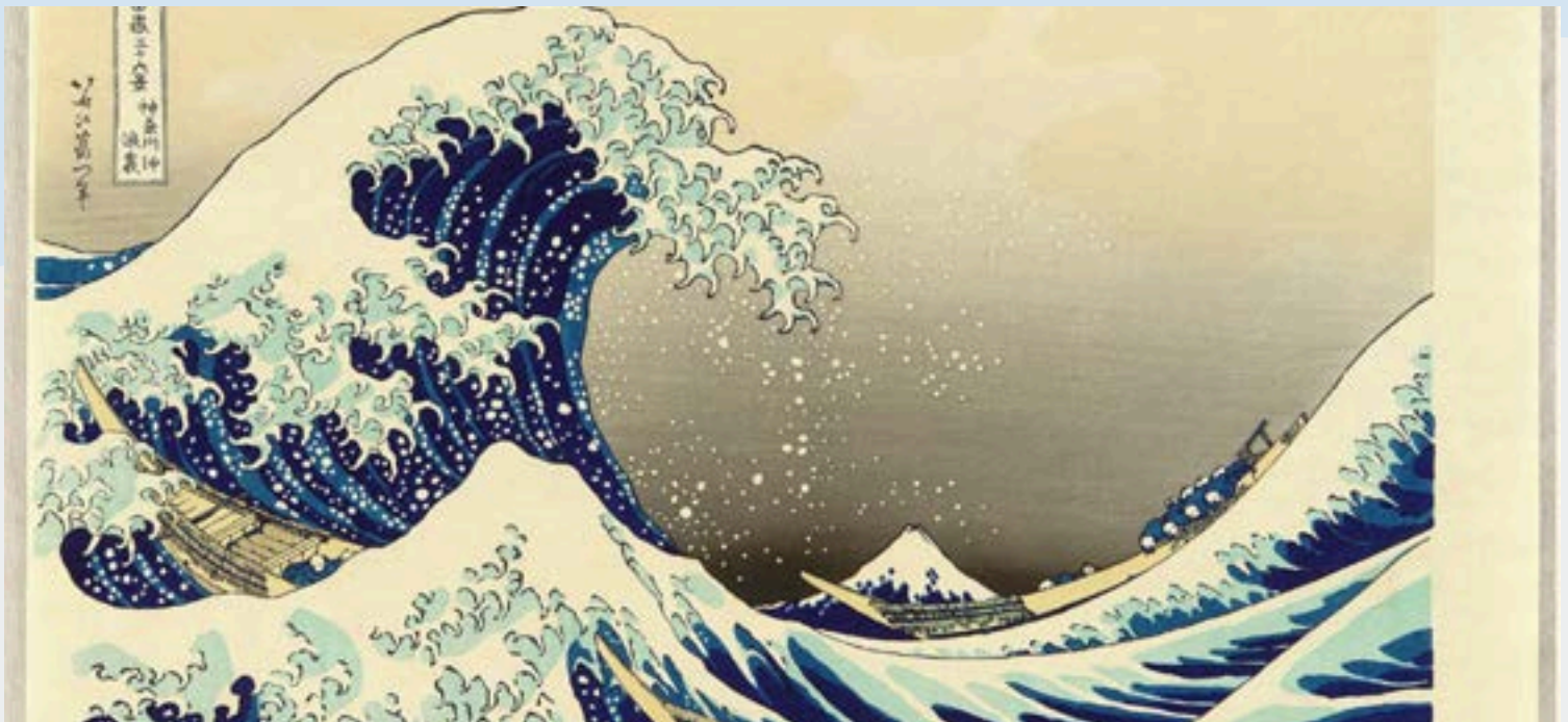
The Great Wave Off Kanagawa by Hokusai Katsushika

The artist we have been focussing on is the Japanese painter Hokusai. We have looked at, analysed and discussed several of his paintings, but have settled on producing a representation of his most famous artwork, 'The Great Wave Off Kanagawa'. We are each going to produce a small replica of the painting, using the painting techniques we have learned. Then we are going to put them together to make a huge collage of the wave. This will show that each piece of work is an individual interpretation by each child, even though the source is the same. This will be the culmination of the whole half term's work on our topic, Japan.