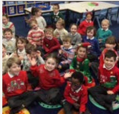
Christmas Jumpers (Year 1)