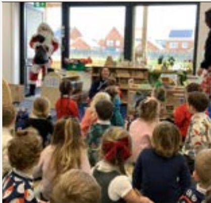
Father Christmas (Year R)