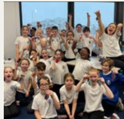
Christmas Crafts (Year 4)