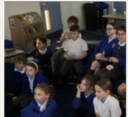
Christmas Film (Year 5)